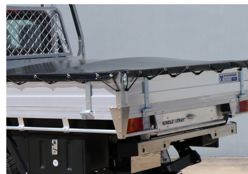
Tonneau Cover - Heavy Duty PVC