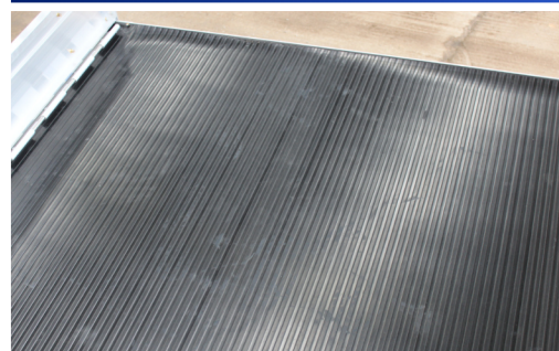
Rubber Tray Mat Heavy Duty - 6mm