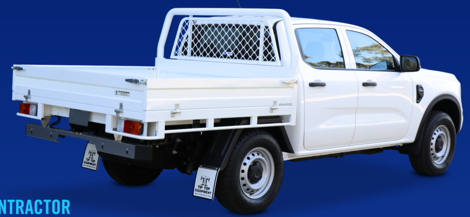
CONTRACTOR HEAVY-DUTY STEEL TRAY