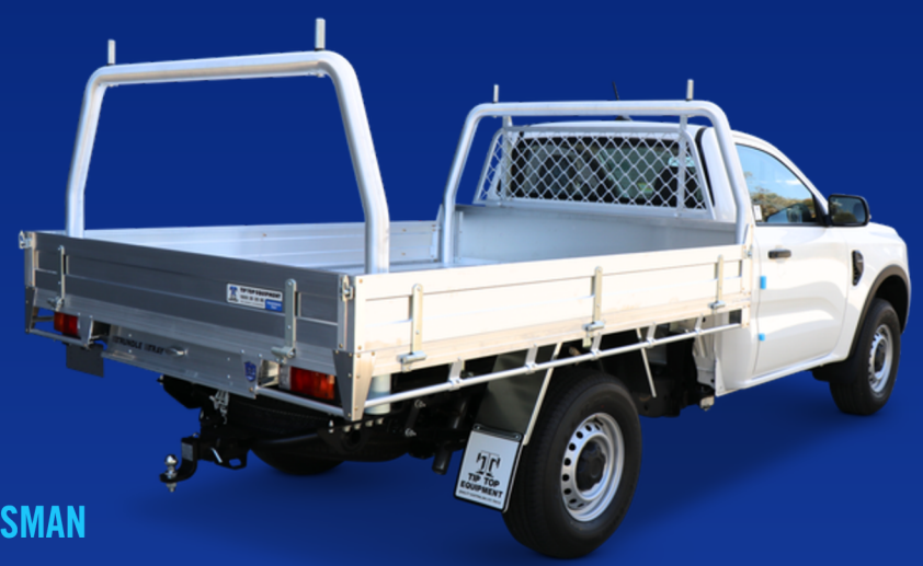
TRADESMAN HEAVY-DUTY ALLOY TRAY