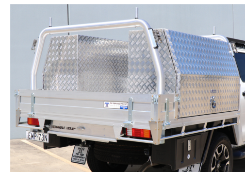
Angled Alloy C/Plate Toolbox with Shelf