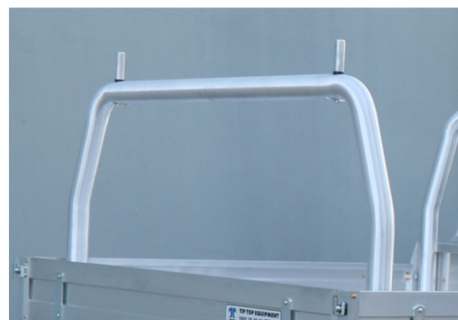
Rear Removable Rack – Tradesman Tray 76mm with 4 x 110mmH Removable Ladder Pins (2 pins on H/Board & 2 pins on Rear Rack)