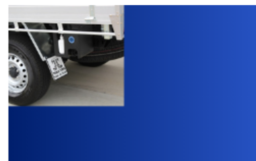
Hand Wash Unit & Soap Dispenser 15 Litres