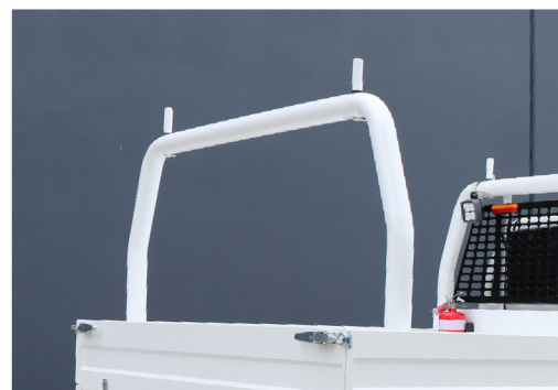
Rear Removable Rack – Contractor Tray 76mm with 4 x 110mmH Removable Ladder Pins (2 pins on H/Board & 2 pins on Rear Rack)