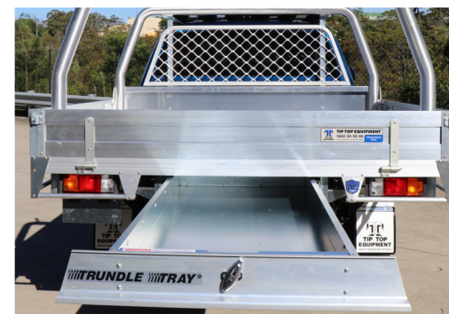
Trundle Tray™ Storage Drawer