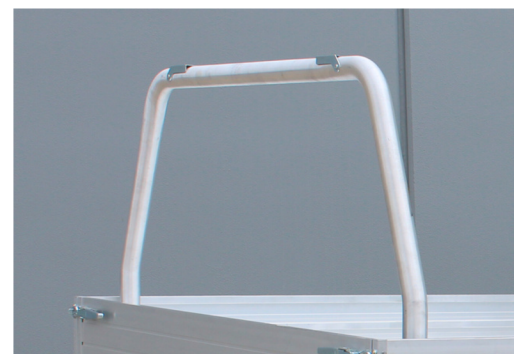
Rear Removable Rack – Taipan Tray 60mm with 2 x Folding Pins