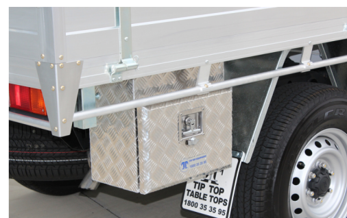
Underbody Toolbox - Alloy Checker plate