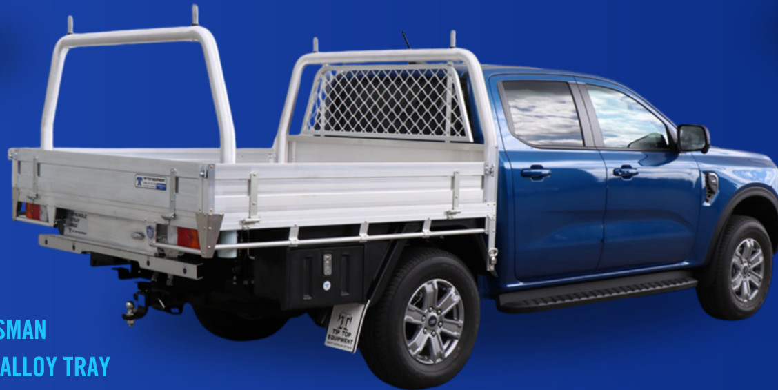
TRADESMAN HEAVY-DUTY ALLOY TRAY

*Pictures shown may include optional Tray Accessories fitted to the vehicle