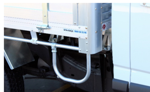
Step Kit Single Tradesman 25mm diameter (Not suitable for Dual Cabs)