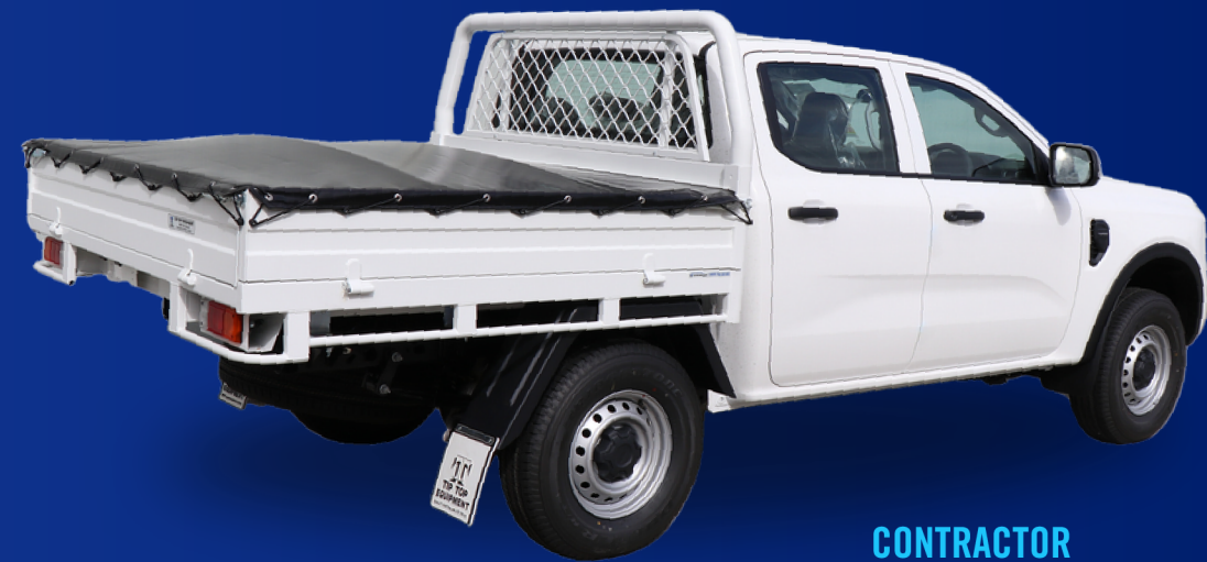
CONTRACTOR HEAVY-DUTY STEEL TRAY