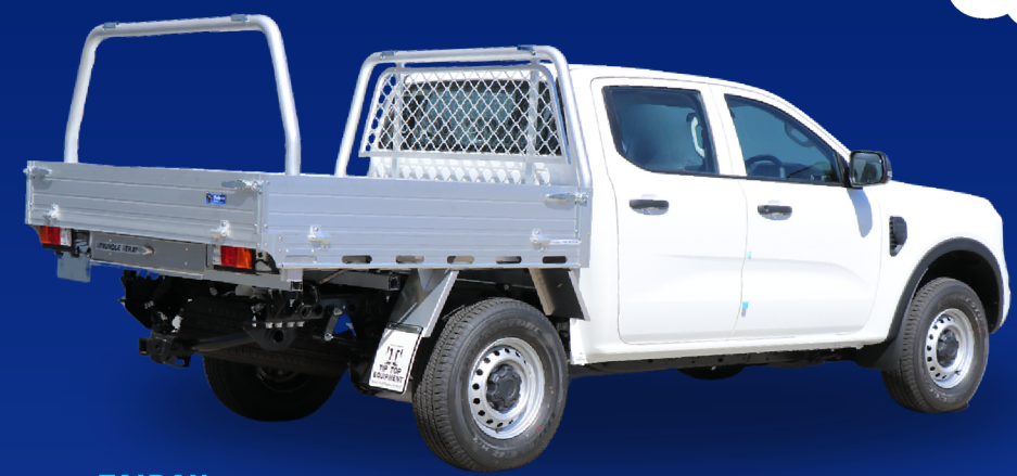
TAIPAN ALLOY TRAY