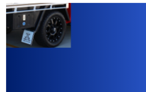
Black Poly Mudguards Black Poly Underbody Toolboxes