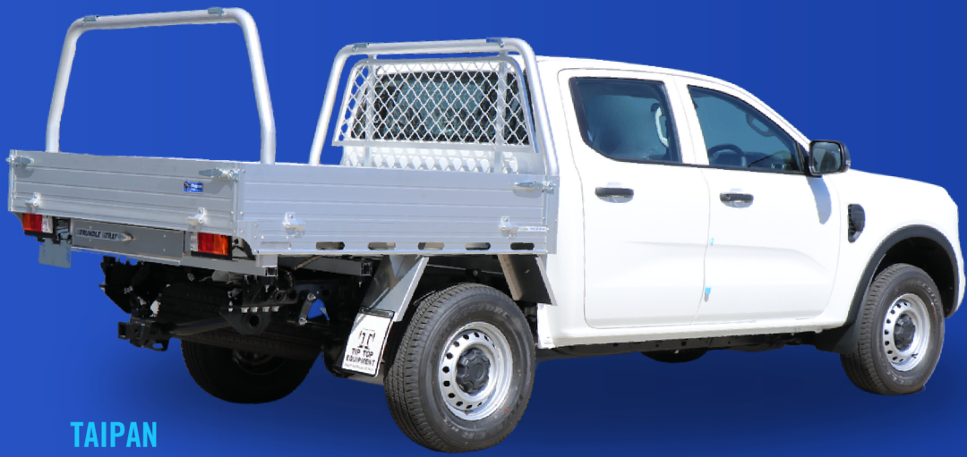
TAIPAN ALLOY TRAY